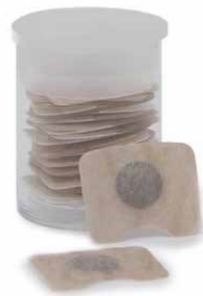
AC Nose Strip Refill Pack RRP $21.95 7104921