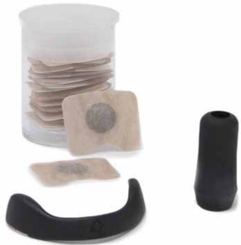
AC Band Complete Kit RRP $45.95 S/M (0) L (1) XL (2) 7104918 7104919 7104920