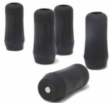
AC Magnetic Applicator (5 PK) RRP $15.95 7104922